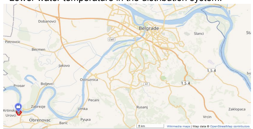
Figure 2: Map of Belgrade area, where it can be observed the distance that the TENT-A pipeline will cover (plan in progress).